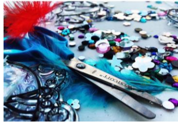
Above: Crafts at the carnival!