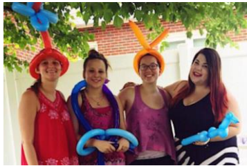
Above: Fun at the carnival!