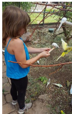
Above: Parakeet Landing at Reptile Land!

Additionally, there were several amazing summer trips planned this year including Kidsburg, Reptile land, Bloomsburg Children's Museum, Pioneer Tunnel Coal Mine, Town Park, Bloomsburg Theatre Ensemble, Bloomsburg Town Pool, and Knoebels!