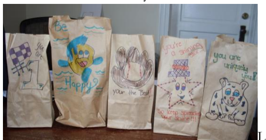
lunches donated and decorated by NCSTU!