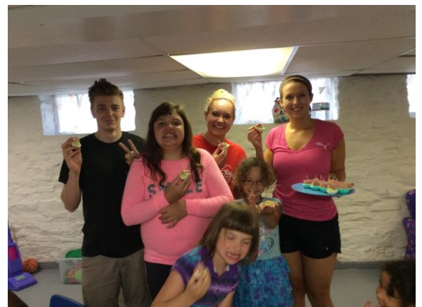
Above: A healthy dose of green eggs and ham!