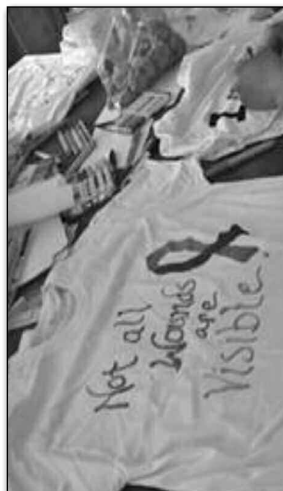
Pictured Below: All TWC staff created a t-shirt for the event.

During the month of April, we organized many different events throughout Columbia/Montour Counties to raise awareness for sexual assault. With the help of Bloomsburg University students we were able to organize our Paint the Town Teal campaign. Paint the Town Teal raises awareness for sexual assault by painting teal ribbons and sexual assault statistics around Bloomsburg, Buckhorn, and Danville. We distributed coffee sleeves and window clings to all businesses in the surrounding area. Both the coffee sleeves and window clings stated the following: "Believe and Support Survivors, Help, Hope and Healing." This year Bloomsburg University's Women's Resource Center helped us organize our campaign on campus as well. We also participated in The Clothesline Project held by Bloomsburg University. The Clothesline project raises awareness of violence against women. Each person is given a white t-shirt and they write information about sexual assault or help dispel myths about sexual assault. The shirt is then hung on a clothesline. The intention of the display is to honor survivors and act as a memorial for victims. It is also intended to aid in the healing process for those who were directly affected and those who have lost someone to violence.