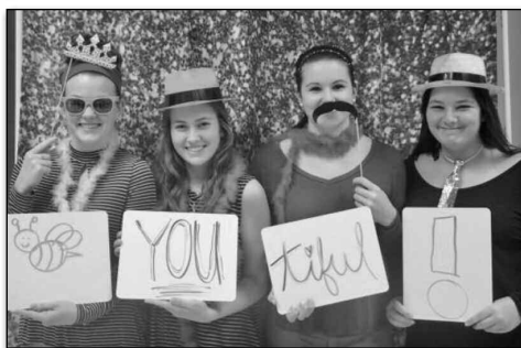
Students from Benton High School.

With Valentine's Day around the corner, we'd like to remind you that everyone deserves a safe and healthy relationship. Remember love has many definitions, but abuse isn't one of them. If you or someone you know has a question about a relationship, healthy or unhealthy visit loveisrespect.org , text "loveis" to 22522, or contact our local Women's Center at 570.784.6631.